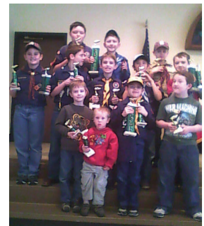
Loblolly District Derby Winners