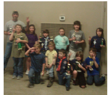
Conquistador District Derby Winners