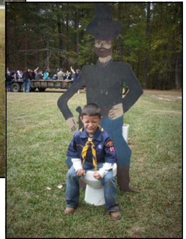
(Create your own Caption)