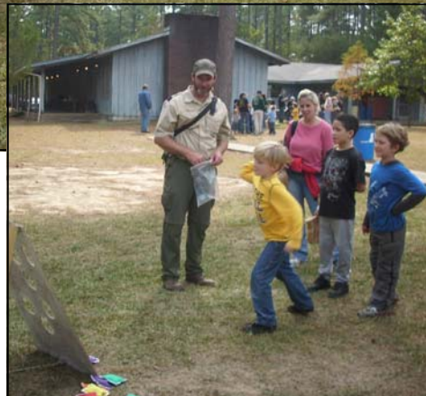
Bean Bag Toss